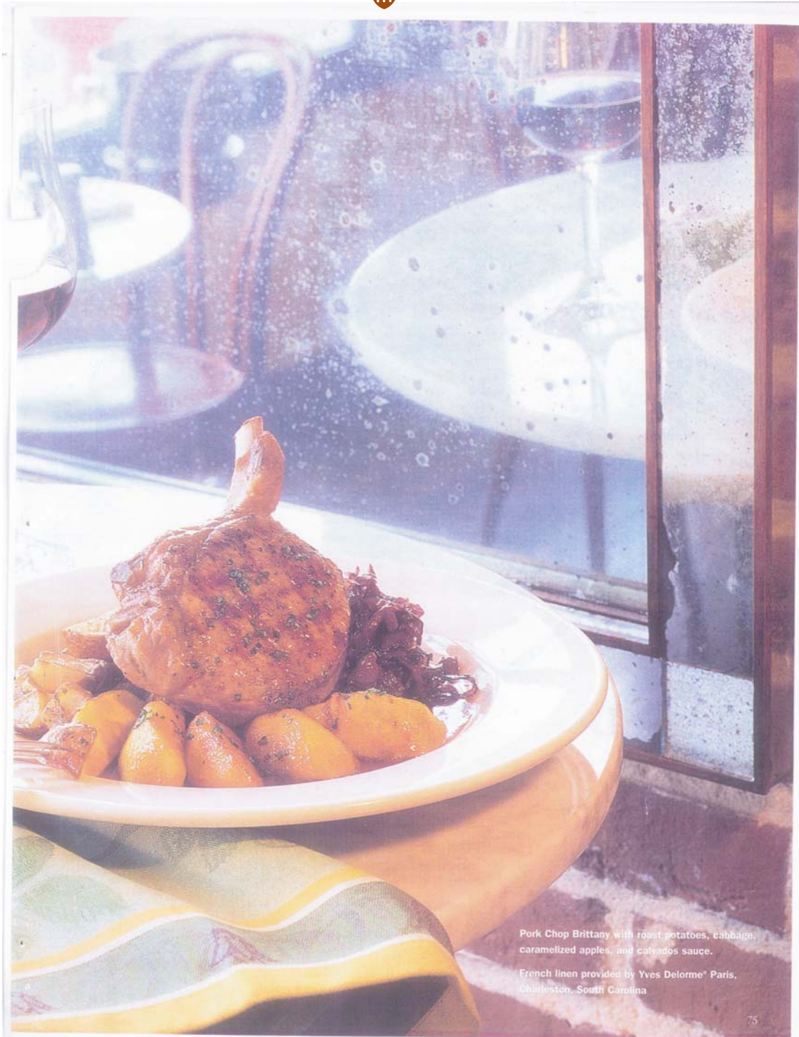
Pork Chop Brittany with roast potatoes, cabbage, caramelized apples, and calvados sauce.

French linen provided by Yves Delorme® Paris, Charleston, South Carolina